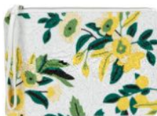
Off 5th SAM EDELMAN $49.99 $128