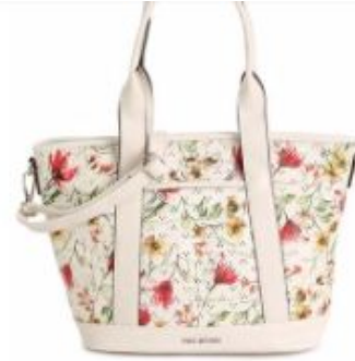
DSW MAX STUDIO $29.98 $39.99