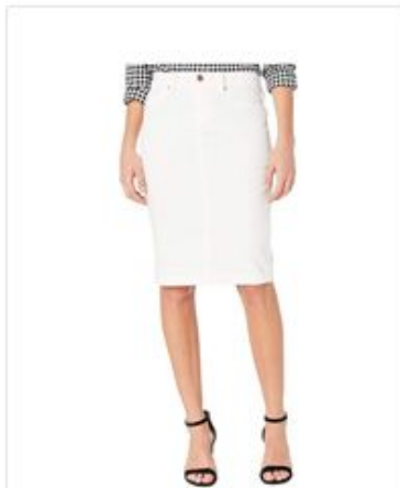
Zappos BLANK NYC $78