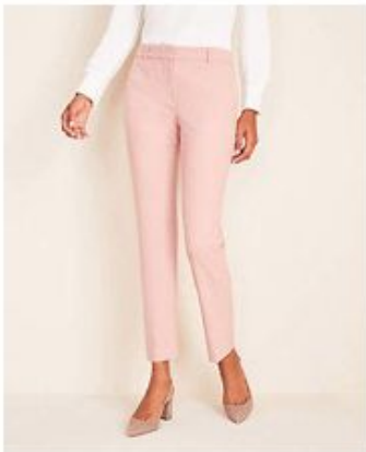
Ann Taylor ANN TAYLOR $98