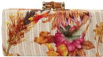
Last Call by Neiman Marcus NEIMAN MARCUS $73.5 $105