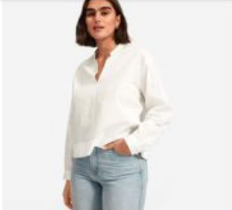
Everlane EVERLANE $55