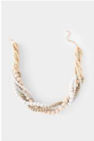
Francesca's FRANCESCA'S $30