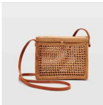
Club Monaco CLUB MONACO $112.99 $210