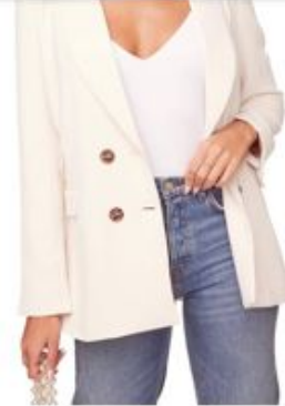
Nordstrom ASTR THE LABEL $158