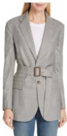
POLO RALPH LAUREN