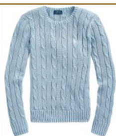
Saks Fifth Avenue POLO RALPH LAUREN $98.5

Clockwise from top left: blue sweater / drop earrings / lemon clutch / pale yellow denim / belt / wedges