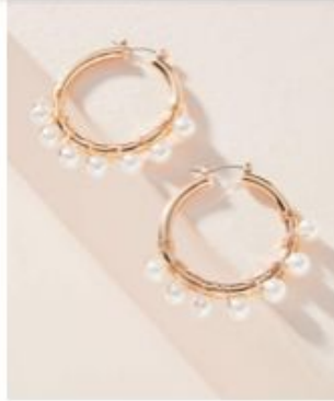
Anthropologie ANTHROPOLOGIE $36 $48