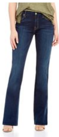
7 FOR ALL MANKIND