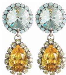
Intermix DANNIJO $180