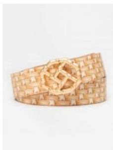
J.McLaughlin RUBY REVERSIBLE LEAT... $118