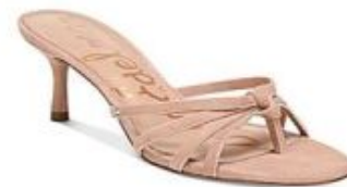
Bloomingdale's SAM EDELMAN $140

Find my blog HERE to shop the above outfit.