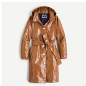
J.Crew J.CREW $368