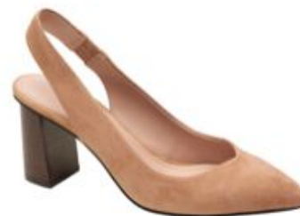
Banana Republic BANANA REPUBLIC $128

Find my blog HERE to shop the above outfit.