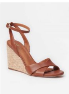
J.McLaughlin LEANNE LEATHER WED... $248