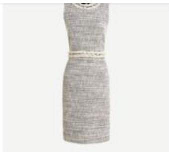
J.Crew J.CREW $188