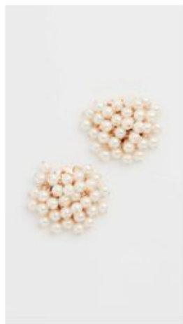
shopbop.com LELE SADOUGH $225