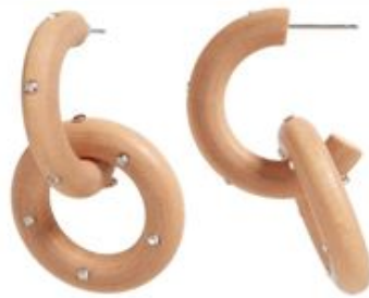
Banana Republic BANANA REPUBLIC $48