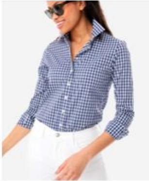
Tuckernuck THE SHIRT BY ROCHELL... $94