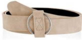
SILVER URBANISM WO...