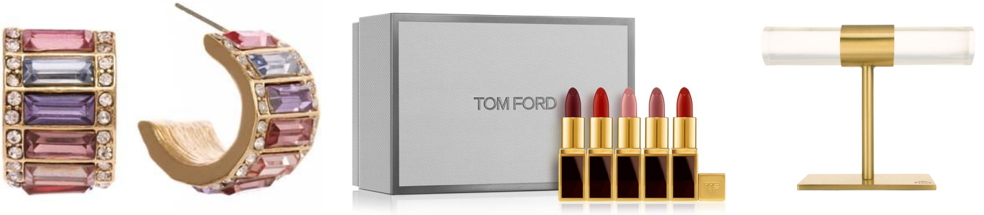
Multi Stone Huggies ($19.97), Tom Ford Lipstick Set ($75), Jewelry Stand ($80)