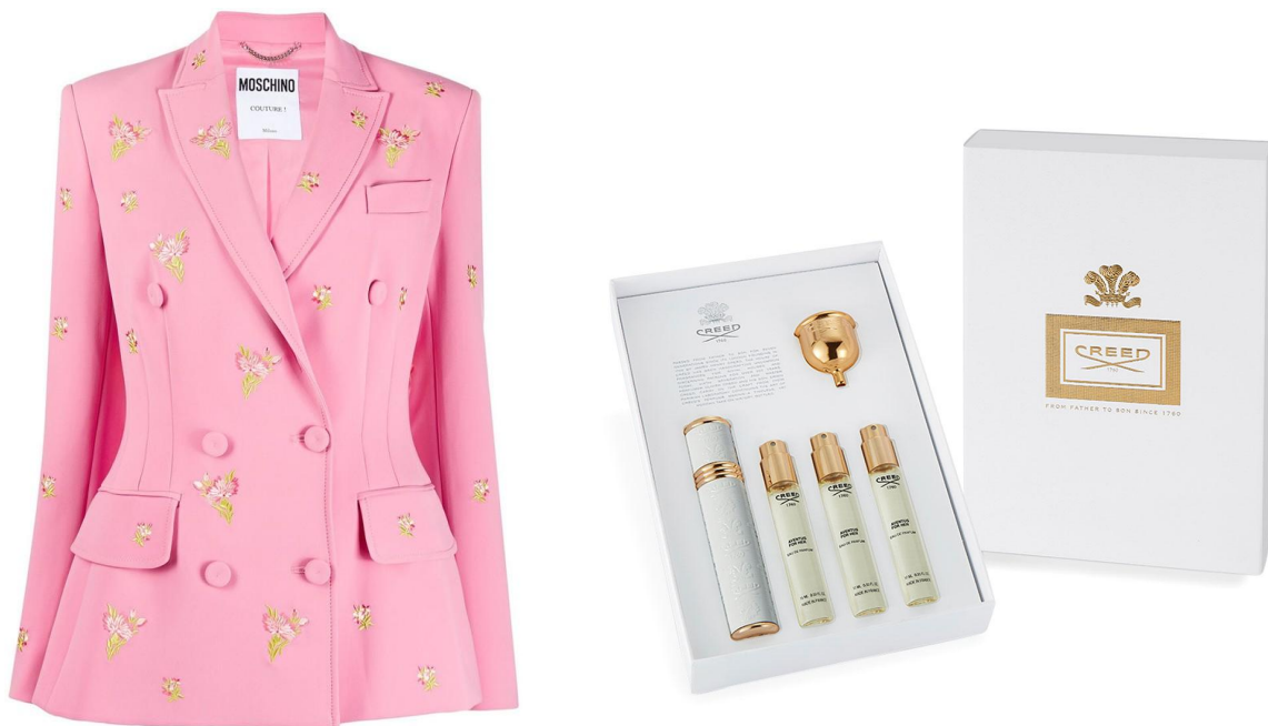
Embroidered Pink Blazer ($2,670), Creed Fragrance Travel Set ($295)