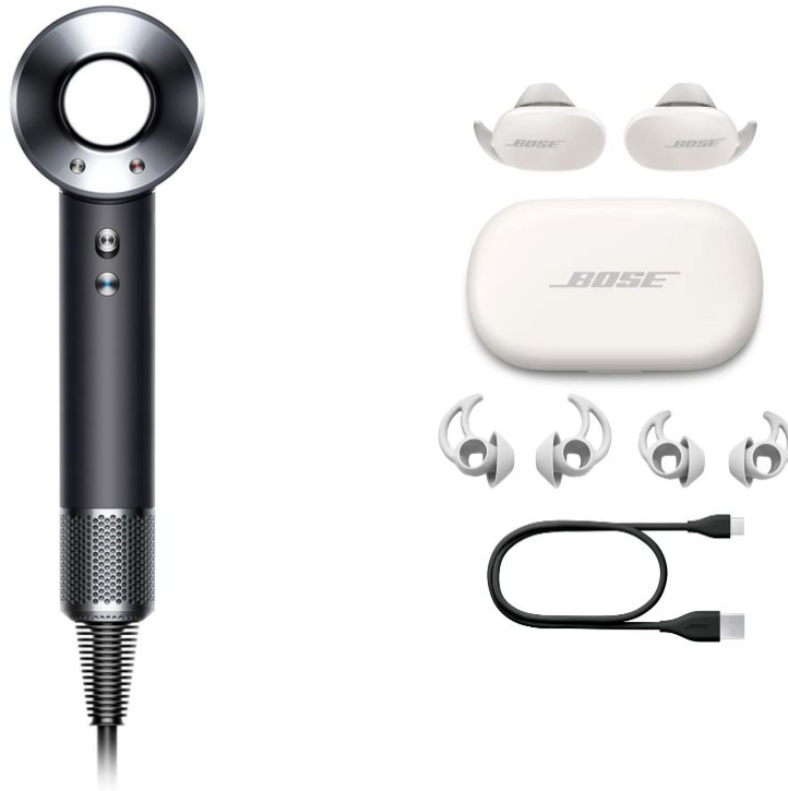
Dyson Supersonic Hair Dryer ($399), Bose Earbuds , $279