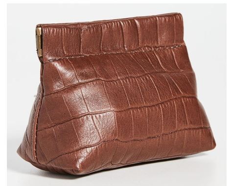
Starfish Slippers ($59), Pointelle Sweater ($79.99) (More sizes available here ), Croc Clutch ($35.60)